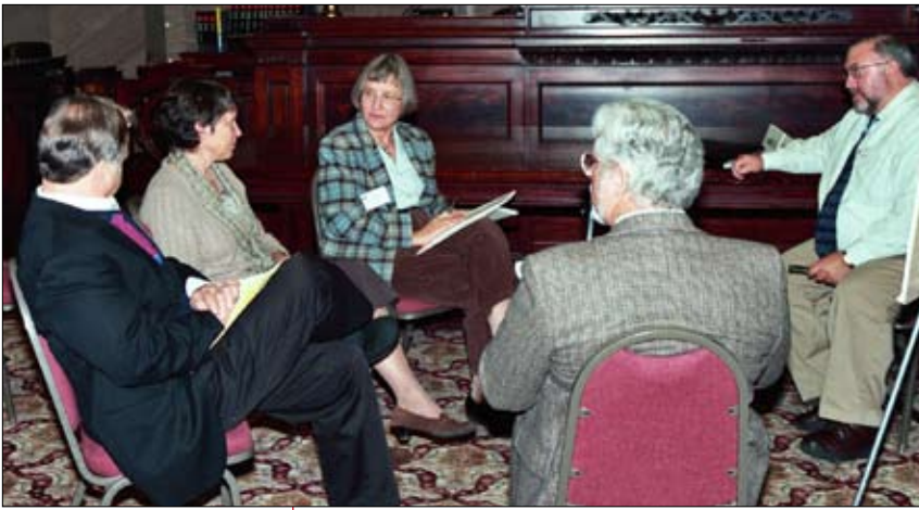
A small group discusses regional and national philanthropic investment in Montana.

If Montana could bring this off, it could be a model for the country.